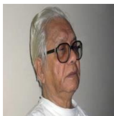
Prof. Badruddin Umar