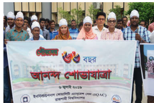
Observation of 66th Founding Anniversary of RU