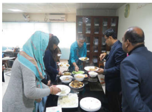
Celebration of the 31st December of 2019