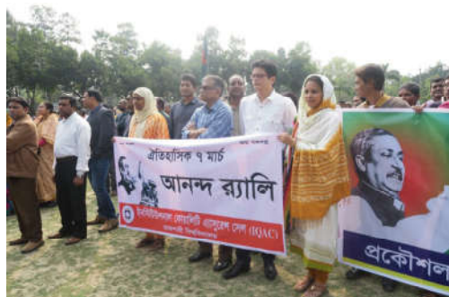
Historic 7th March Observation