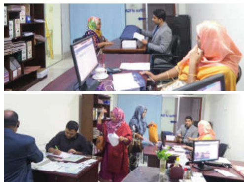
Distribution of kits for the 11th Convocation 2019