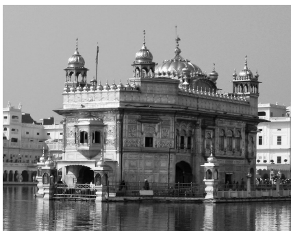
ճՎԱրճի ԱցԶմաճի ի Օ՛Կն ի իՐ (1760)