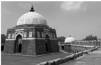
Խաճնիմ Ըմր Յճի ԻԿի ղղնա, 1325 (ԷԶԳրիճ իմԵ Կալկի Բյնկա իմԵ)