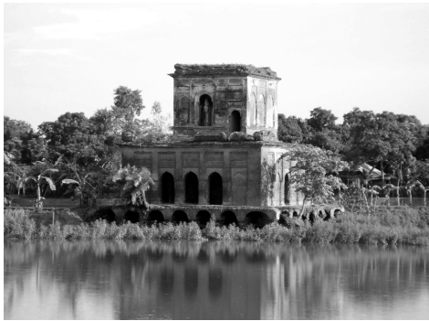
Zv ic v t n l q l v br (DE t i - c u o t g w - K t t - t ki )

wZj Astki K t yi Ašli - tPSPjv Ort - i ga - Lvtb GKw dj - bKkv - k - gvb | K t yi Db Q wLj vbc - mgr Dch Q mi Oq arc we k ó LuR bKkvq tkw f Z | K yi Ui ce Q w - t ki wZb wLj vbc t _i g t a - - wcz - K - t mi j wqZ Ges w ki v t jv bKkv h | wLj vbm g ni Dcwi fvtM - B tKvYq - K t i t j v ni w k K t i i w is we - gvb hr Q iv AbygZ nq th, D 3 w k K j t j v t Z c - PAvU Q K t q K t yi tMcbxqZv i yv Kiv n t Zv | K yi Ui einf Q Mi c u o t g t - q t j wZbiU, DE t i t - q t j i c Q ekc t _i ce Q c vt k GKw Ges - w - Y t t - q t j i c Q ekc t _i - B c vt k - tgvU Q qu U wLj vbvKwZi c - vtbj we - gvb | ZvQvorl BgviZiUi einf Q Mi c u Zw - t ki K w b Q ki w g usk AvqZvKvi Abyg Q K c - vtbj wef 3 | bXPZjvi wLj vbc - mg ni c Q e Q PAvUK vt bri e - e - v Q j e t j AbygZ nq | Zv ic v t i GB BgviZiUi Af - šli I einf Q M tZgb tKv t br AvKl Q q AjskiY br - vK t j I c Q wiYxi ga - t j w ic gZ n l q q G u Ui t ms h Q K e u j c wi g t Y e Q K t i q | c Q e Q BgviZiUtZ t b S vt h vt M hvZvqZ Kiv n t j I eZ Q vtb c Q wiYxi ga - e iv ei ce Q c u o t g GKw AvBj w - t q c Q wiYxiUt Q K wef 3 Kivq D 3 AvBj wLj BgviZiUtZ hvZvq t Zi c - w t mt e e - e u Z n t Q |